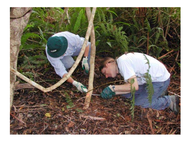
Plate 3: Teaching a volunteer how to poison lantana using the stem frill technique in Ku-ring-gai Flying-fox Reserve, Sydney

(AABR NSW) in 1986. AABR aims to foster the application of sound ecological practices of bushland management by qualified people and to promote the study and practice of bush regeneration (AABR 2006a). AABR Far North Coast & South East Queensland was established a few years ago as a sub-group of AABR NSW. AABR WA is a sister organisation in Western Australia. It is hoped that further groups will establish throughout Australia as the industry grows.