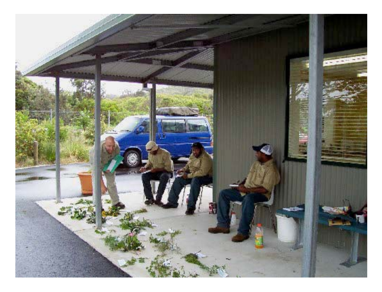
Plate 2: Private bush regeneration trainer conducting a weed identification course with Community Development Employment Program and National Parks and Wildlife Service employees, Arakwal Community, Byron Bay, NSW, 2006.

Qualifications in bush regeneration were originally acquired through a course provided by the National Trust and later through tertiary institutions, especially Technical and Further Education Training Colleges (TAFE). Now bush regeneration qualifications are attained through the nationally accredited Conservation and Land Management (Natural Area Restoration) Training Package.