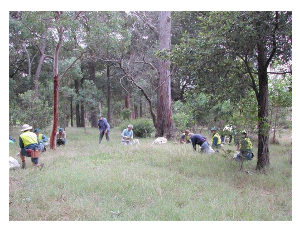
Plate 4: Volunteers and Council staff together regenerating the understorey of Sydney Turpentine Ironbark Forest, a critically endangered ecological community at Killara Park, Sydney

From data provided by respondents it was estimated that the overall paid and volunteer value of the bush regeneration work carried out in the study areas in 2005 was approximately $18 million of which 72 per cent was for paid work ($12.9 million) and 28 per cent was for volunteer work (valued by the respondents at $5.1 million). Each volunteer worked an average of about 40 hours during 2005 but this average rose to 65 hours in the municipality-based areas which commonly have council bushcare programs that organise regular weekly or monthly work sessions.